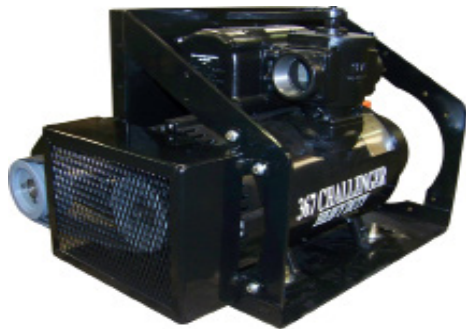
CHALLENGER SIDE MOUNT BELT AND PULLEY DRIVE