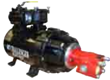
CHALLENGER - HYDRAULIC DRIVE