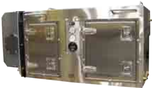
CHALLENGER 4310 BLOWER PRO PAK PLUS