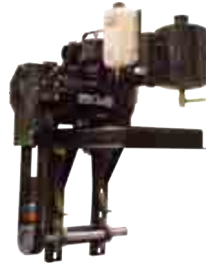
CHALLENGER - TOP MOUNT BELT AND PULLEY DRIVE