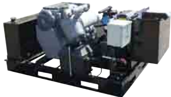
CHALLENGER BELT AND PULLEY ENGINE DRIVE